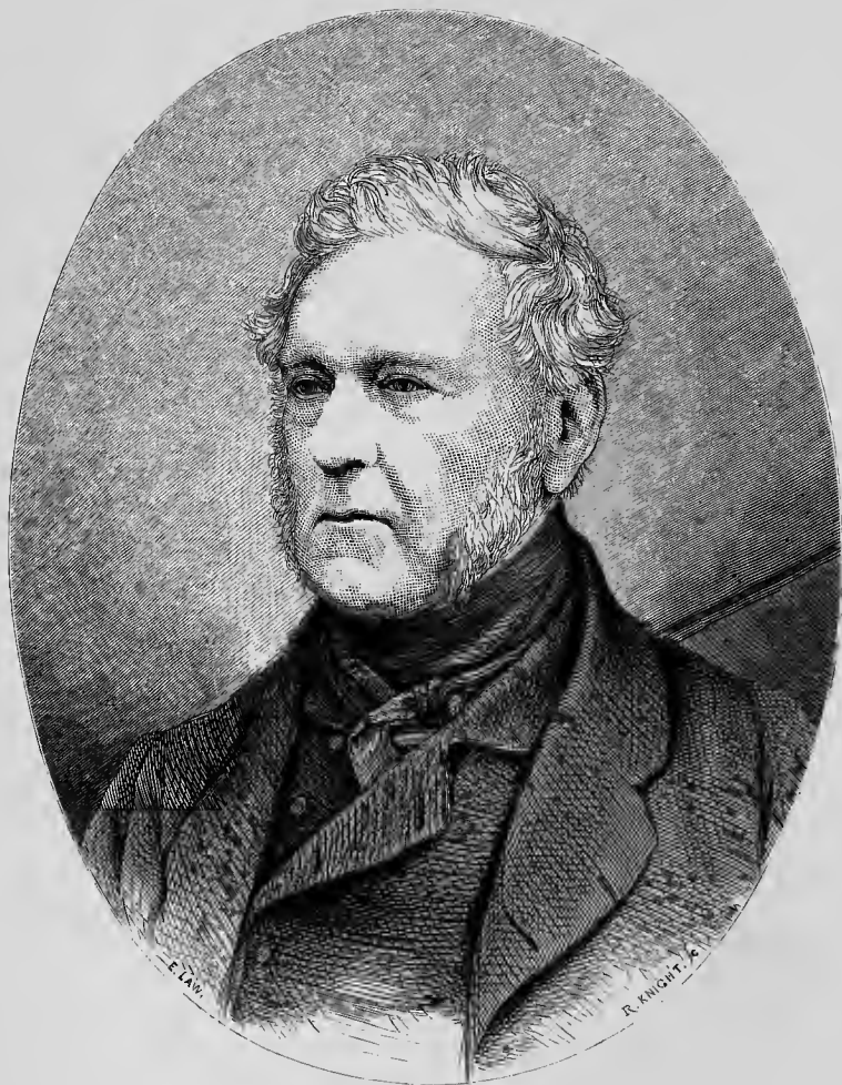
THE HON. ADMIRAL ROUS.